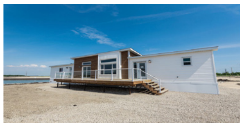
LENNOX $281,219 1,520 SQFT 3 bdrm 2 bath