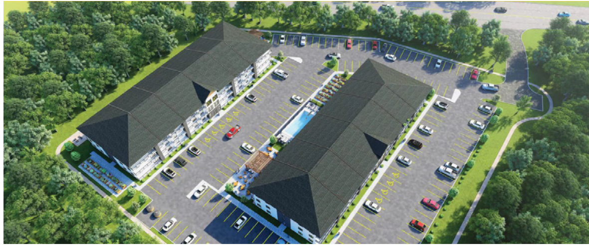
The proposed rental apartment complex.

Wiebe's goal at the time was to construct a professional centre with retail shops and, possibly, industrial