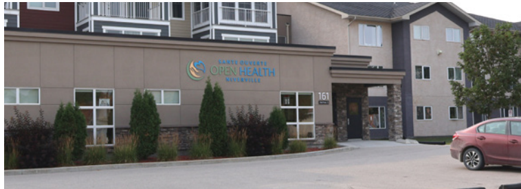
Niverville Open Health.