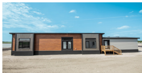
HENLEY $282,665 1,520 SQFT 4 bdrm 2 bath