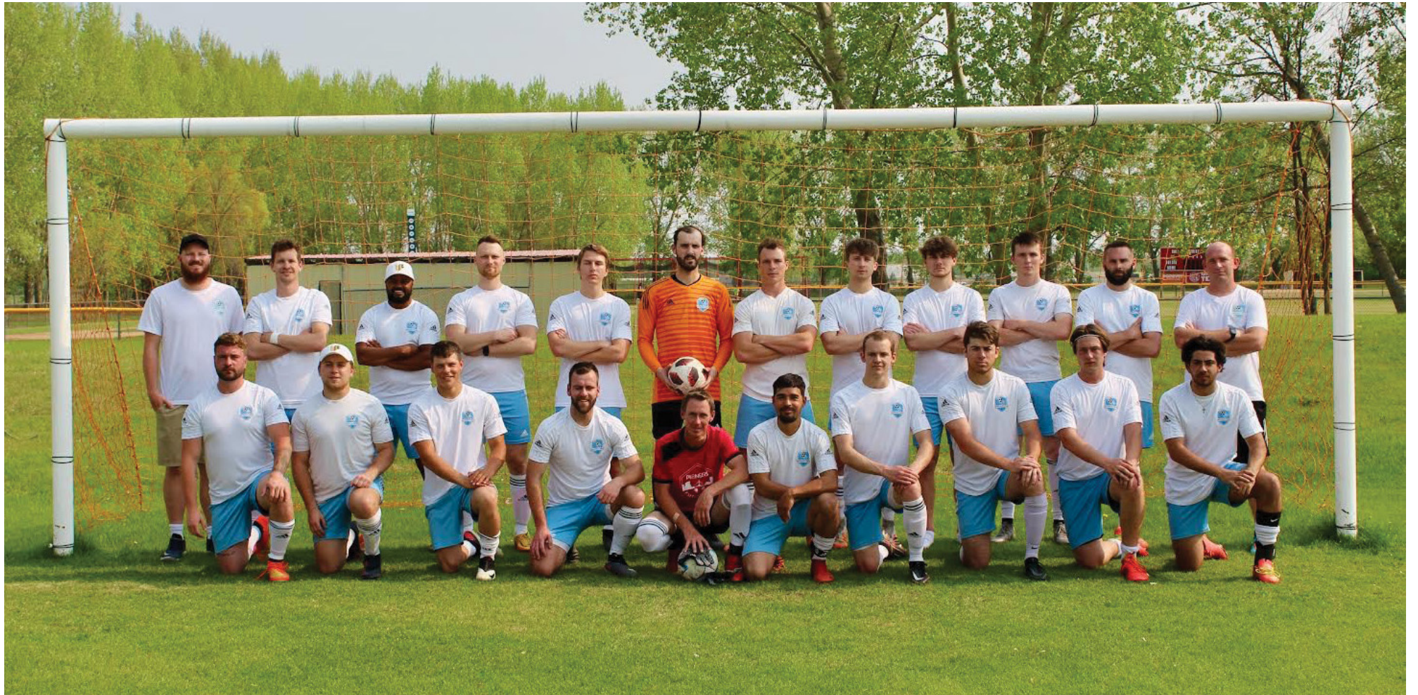
The 2023 Niverville Force.