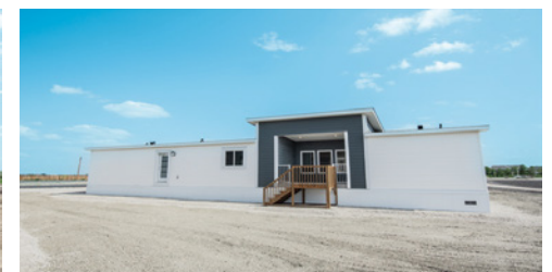
MADLOCK $307,019 1,680 SQFT 3 bdrm 2 bath