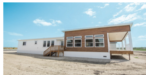
HAVEN $281,219 1,536 SQFT 2 bdrm 2 bath