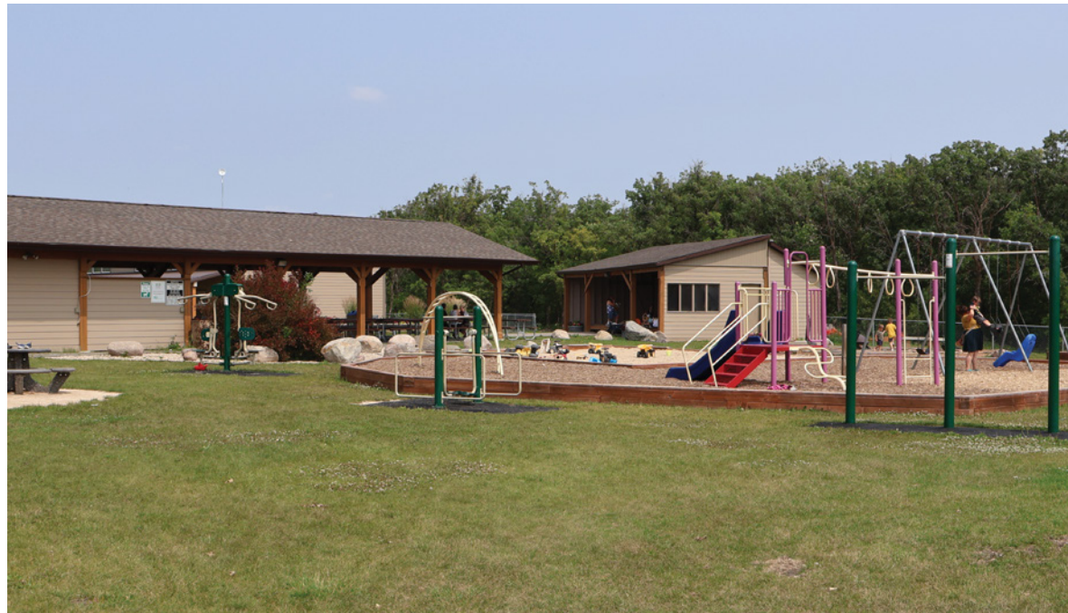
Grande Pointe Park will host an outdoor concert later this summer.