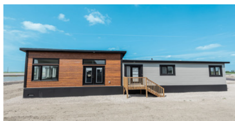
HAWTHORNE $234,161 1,044 SQFT 2 bdrm 1 bath