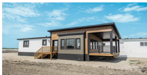
LAWSON $242,107 840 SQFT 2 bdrm 1 bath