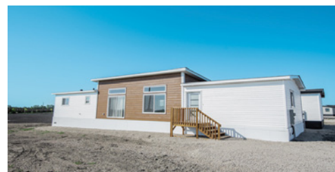
TEMPEST $260,993 1,280 SQFT 3 bdrm 2 bath