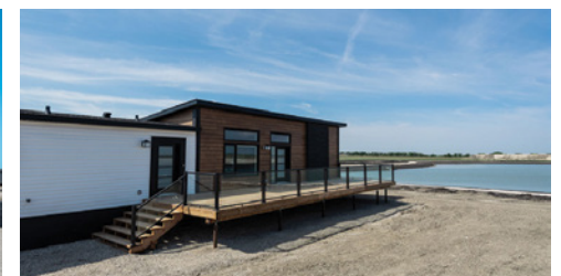
KNOX $268,217 1,360 SQFT 3 bdrm 2 bath